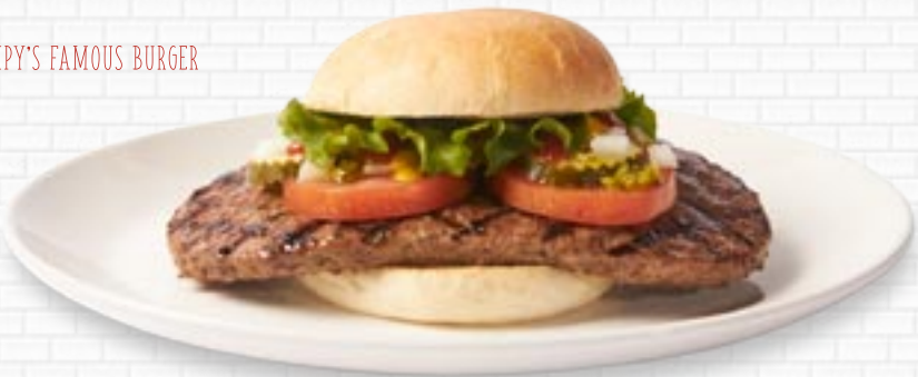
WIMPY’S FAMOUS BURGER

Sub Onion Rings 550 Cals or Waffle Fries 470 Cals Add $1.50. Greek Salad 200 Cals or Caesar Salad 375 Cals $4.00