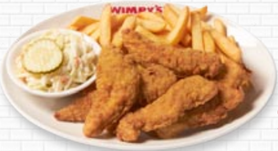
CHICKEN FINGERS AND FRIES

Breaded chicken strips ▫ french fries ▫ coleslaw & pickle. 890 Cals $17.97