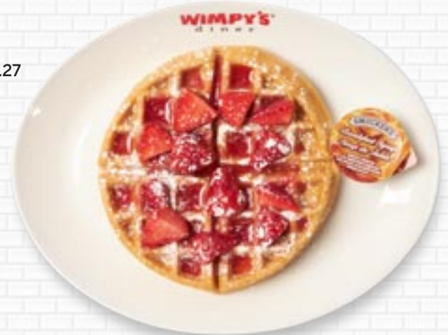
ORIGINAL BELGIAN WAFFLE WITH STRAWBERRY TOPPING

Belgian waffle ▪ blueberries ▪ bananas ▪ strawberry topping ▪ nutella & whipped cream. 825 Cals $18.57