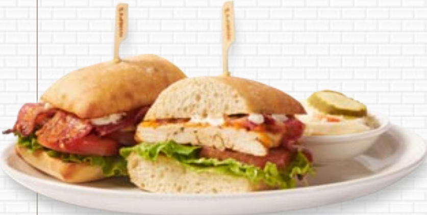
BACON CHICKEN CLUB

The big junior burger ▫ grilled rye toast ▫ sautéed onions ▫ cheddar cheese. 700 Cals $13.97