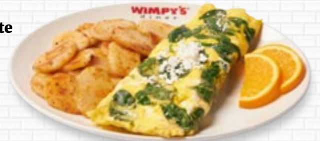
SPINACH AND FETA OMELETTE

Add Hollandaise Sauce To Any Omelette 160 Cals $3.00