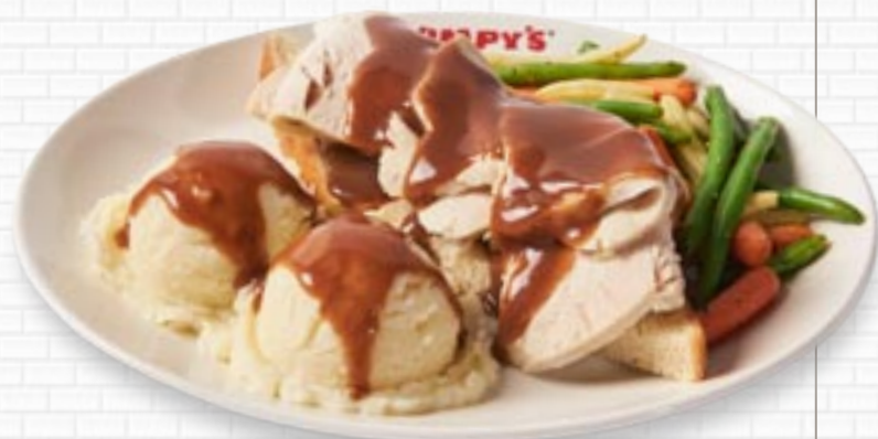
WIMPY'S HOT TURKEY

Lightly breaded haddock • french fries • greek salad • garlic bread. 710 Cals $23.27