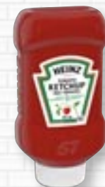
DON'T FORGET THE HEINZ

3pcs Peameal Bacon 120 Cals $6.00 4pcs. Bacon 340 Cals or Turkey Bacon 160 Cals $5.00 Ham 120 Cals or Sausage 660 Cals $5.00 Texas Toast or Rye toast with jam 170-200 Cals $2.50 Homefries 350 Cals $4.50 Tomatoes 6pcs 20 Cals $3.00 Grilled Tomatoes 6pcs 75 Cals $3.00 Hollandaise Sauce 160 Cals $3.00 Single Egg 85 Cals $1.50 1pc Pancake 230 Cals $3.50